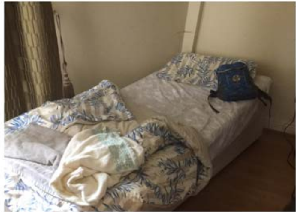
This is a photo of my bed & my travel bag in "The White House".

And this was basically our first day in the capital city of Ireland, Dublin. Stay tuned for Day Two! It'll come soon.