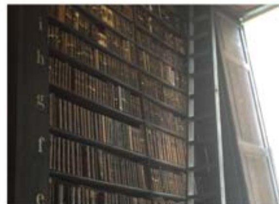
The old library