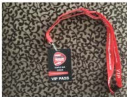
And here's the "key chain".