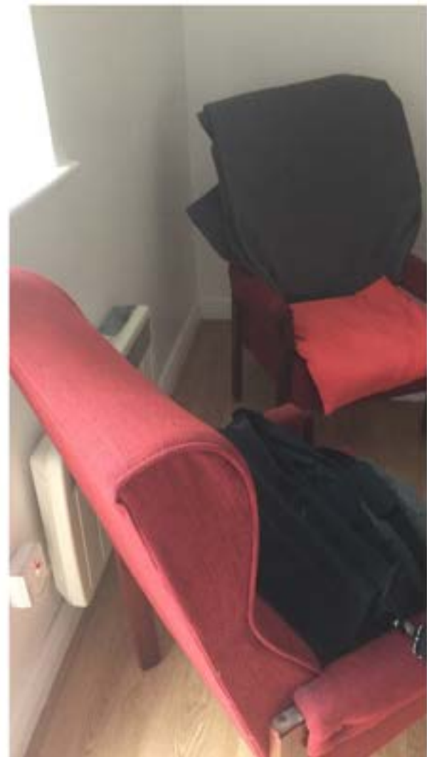
These chairs in the kitchen were REALLY comfortable.

And as I woke up in the morning & went to the kitchen to get some breakfast, I explored the TV that was hanging in the top left corner & I have to say that some of the Irish/British trash shows are way better than that what we get here in Germany. I feel like, Irish/British trash TV has just so much more class.