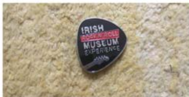
The magnet looks so good & has a great quality!