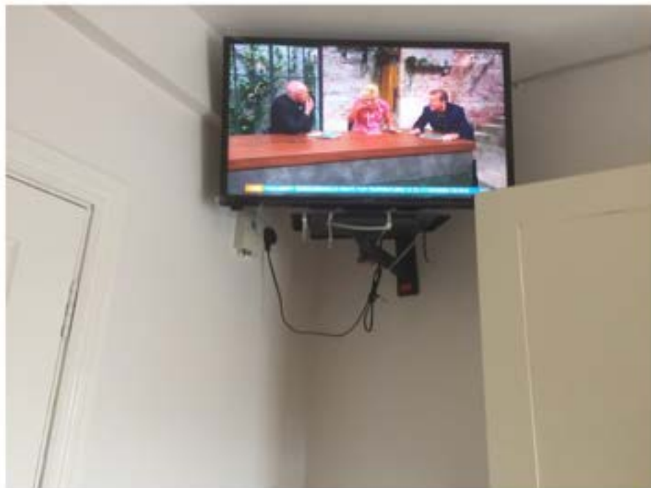
Here we have the TV!

Lovely followers, I wish you all a wonderful morning because I'm back today with day two of my travel blog through Ireland! I hope everybody enjoyed the first day!