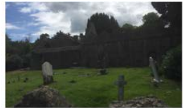
A graveyard by the castle