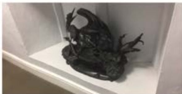
The fancy bird "statue"