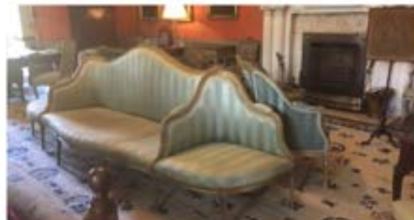
A couch inside the castle