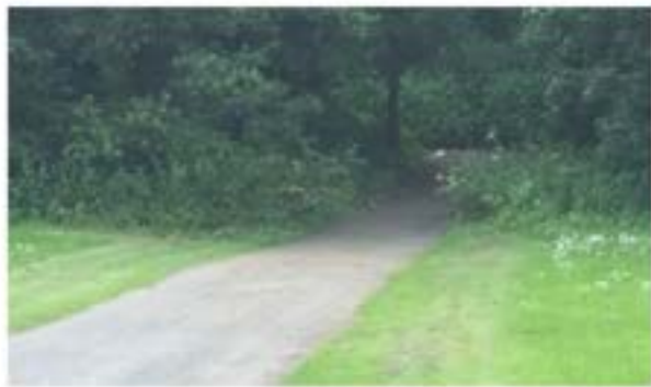
A way to the castle